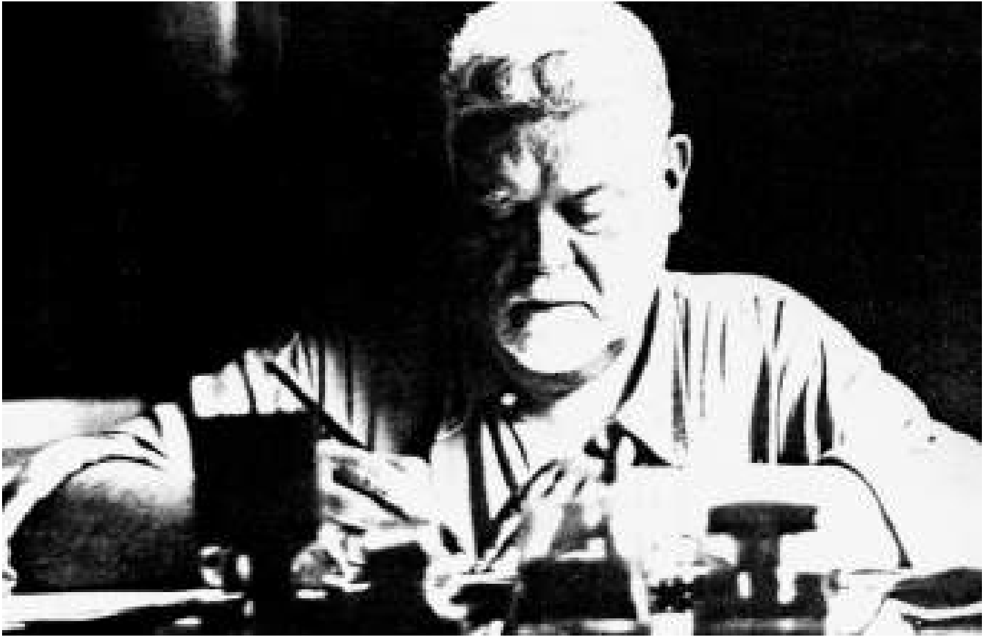
GIOVANNI GENTILE (1875 / 1944)